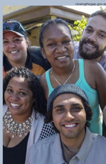
Closing the Gap report listed 19 socio-economic outcomes for Aboriginal and Torres Strait Islander people.

As for whether or not it will help close the gap between Indigenous and non-Indigenous Aussies - time will hopefully tell.